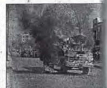
BACKLASH: A truck on fire in Ahmedabad.

The Work Board office in Gandhinagar was burnt down in the riot.