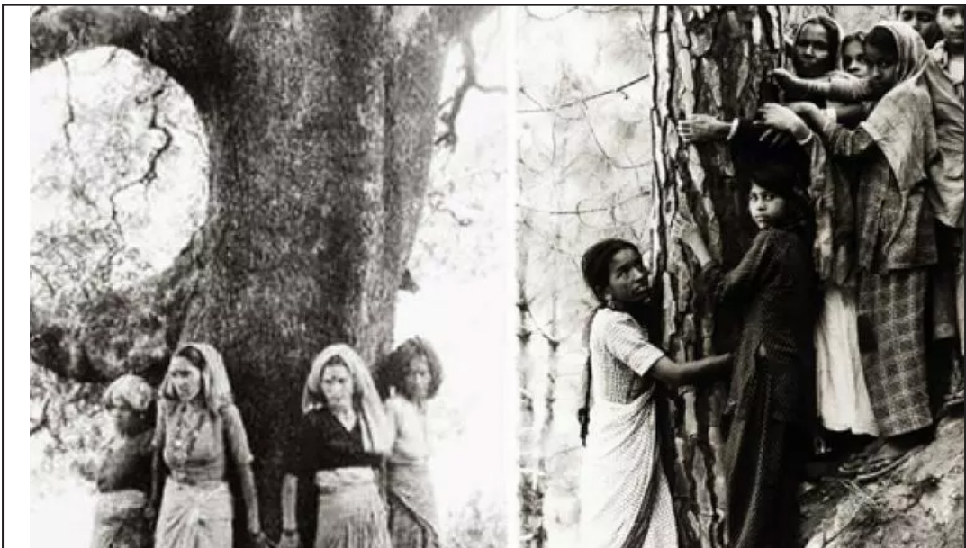
Chipko activists hugging trees

The Chipko Andolan was the pioneering environment movement in India. It emerged in 1973 in the present state of Uttarakhand. The movement tried to address multiple issues. The villagers were dependent on the forest for their livelihood. The forest department deprived this by denying permission to cut down the ash trees. At the same time, the government gave the same to a sports manufacturer leading to indiscriminate cutting down of trees. Opposing the government's move, the movement demanded that no forest exploiting contracts shall be sanctioned to outsiders. The movement also demanded that the government should provide material for small industries and maintain a balance between ecology and development. The movement further highlighted economic issues of landless forest workers demanding minimum wage and also that the locals should have control over natural resources. Thus, the movement showcased the disastrous consequences of tree felling such as ecological degradation, soil erosion, landslides and more importantly the livelihood of forest dwelling communities. Chipko movement employed the Gandhian mode of peaceful protests and tree hugging tactics to raise awareness regarding the issue. The movement was led by activists such as Chandi Prasad Bhat and Sunder Lal Bahuguna.