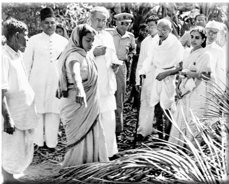
Gandhi visiting Noakhali

down. The communal fire that was spreading across the nation suddenly came to an end. Hindu-Muslim communities started to work towards reducing tensions across the country. The government also started intervening by clamping down on organisations such as the Rashtriya Swayamsevak Sangh.