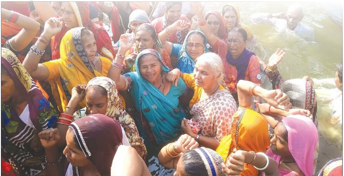
Jalagamadhi protest by the activists of NBA

Medha Patkar, the leader of NBA argued that the project would adversely affect the farmers as well as the tribal population as it would drown 245 villages and displace around 2.5 lakh villagers. It would also have a serious impact on the ecological balance as the construction of numerous dams would drown vast areas of forestland. The movement attracted worldwide attention through its mode of struggles. The movement was successful in ensuring rehabilitation and fair compensation for the displaced. However, despite the concerns raised by NBA and global environmentalists, the project was completed. Overall, the Narmada Bachao Andolan succeeded in highlighting the ecological cost incurred by large development projects such as the Sardar Sarovar and the relevance of the need for a more inclusive and sustainable models of development.