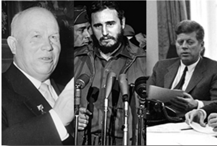
Nikita Khrushchev, Fidel Castro, John F Kennedy

regime of Cuba under Fidel Castro from an imminent US invasion, Nikita Khrushchev, the premier of the USSR, decided to convert Cuba into a military base. The USSR placed nuclear missiles in Cuba targeting the USA. Three weeks after this development, the USA became aware of the nuclear threat. American President John F Kennedy ordered a naval blockade to Russian ships bringing the world to a brink of war with Soviet Union. The whole world became nervous because of the possibility of a nuclear war between the two super powers. After a negotiation both sides decided to avoid war.