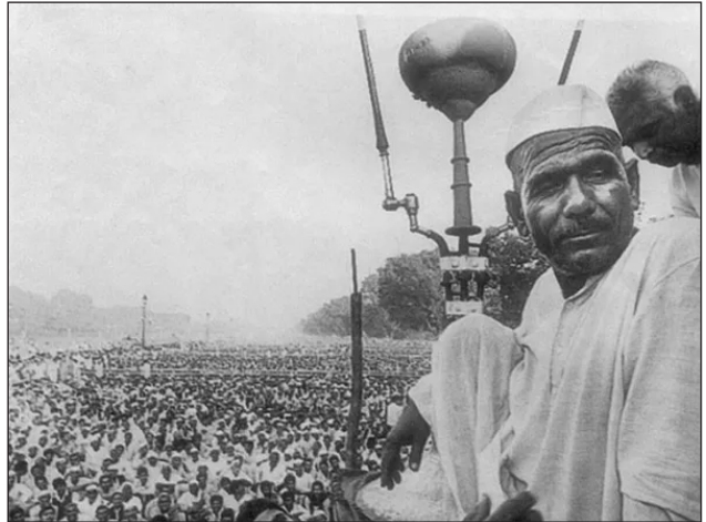
Tikait leading BKU protest

The Bharatiya Kisan Union was one of the prominent Farmers' movements in India. Established in 1987 by Mahendra Singh Tikait, the movement aimed to address the issues and concerns of farmers. This includes the demand for a fair price for agricultural products, loan waivers, irrigation facilities, loan subsidy, reduction in the cost of farming equipment and other inputs, reforming of trade and marketing policies so as to protect farmers' interests, pension for farmers, higher floor price for sugarcane and wheat, abolition of restriction on the inter-state movement of farm produce and electricity at subsidised rates. Over the years, BKU has organised several rallies, sit-ins, demonstrations and