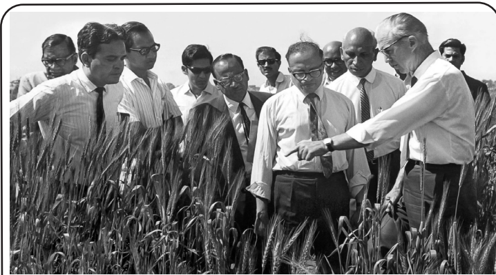
M S Swaminathan and Norman Borlaug

emergence of a new class of rich peasants subsequently led to rural tensions between landlords, middle peasants as well as landless peasants leading to the rise of Leftist politics in many states.